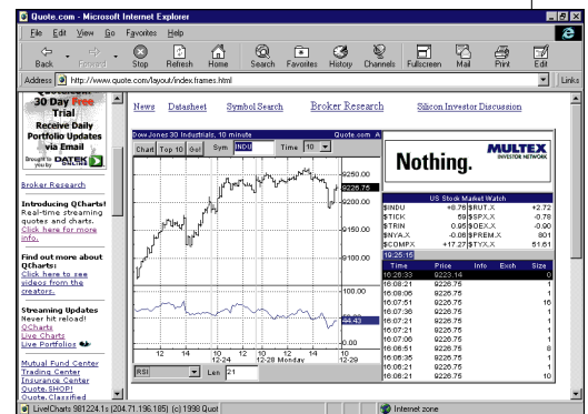
FIGURE 1: LIVE! CHARTS. Quote.com's LIVE! Charts feature is a good way to sample the versatility of Quote.com's data products. LIVE! Charts provide real-time streaming data for several indices, such as the Dow Jones Industrial Average.

I installed and tested QCharts using a T-1 line on an HP Vectra VL Series 3